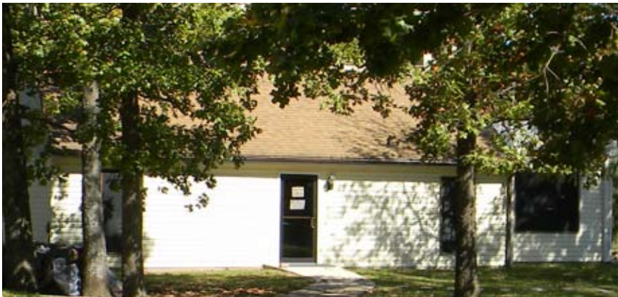
Sophia's Nest Bookstore & Coffee Shop